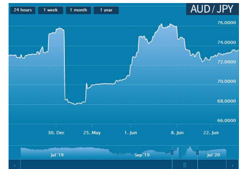
AUD/JPY exchange rate fluctuation from 1st Jan to 1st Jul, 2020

Therefore, it is important that businesses systemically manage the FX risk, including quantifying the FX risk, using multiple tools including FX swap, forward and options to minimize the FX risk and business exposes.